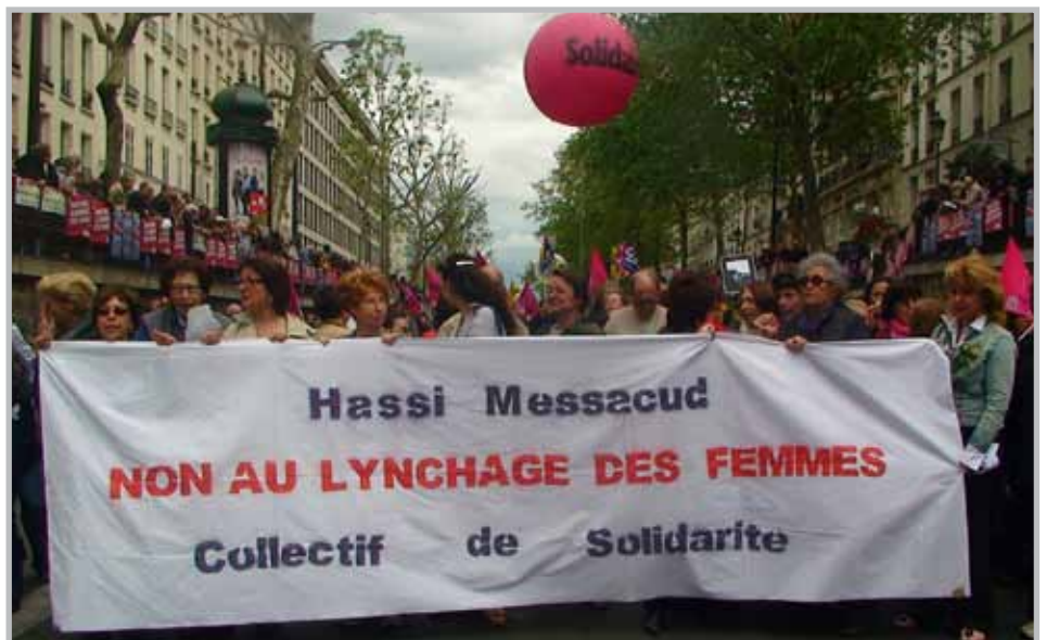
Solidarity for the women of Hassi Messaoud: a street march in Paris, May 2010