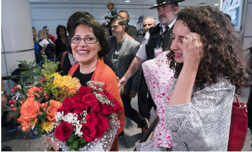
Homa Hoodfar, after 112 days of incarceration in Evin Prison in Iran returns home