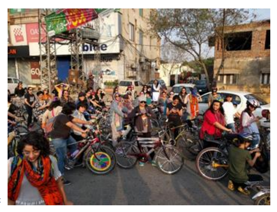
'Girls at Pakistan